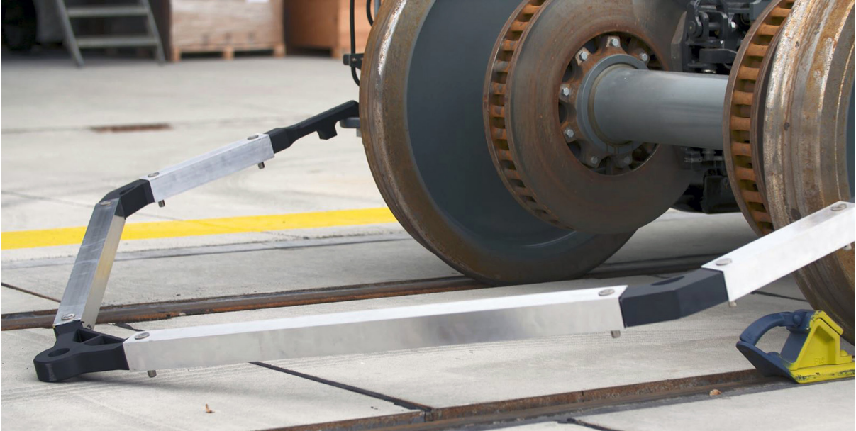
Siemens Mobility is now using its Fortus 450mc to make one-off tools customized to each bogie in a matter of hours.

Kuczmik concluded, “The ability to 3D print customized tools and spare parts whenever we need them, with no minimum quantity, has transformed our supply chain. We have reduced our dependency on outsourcing tools via suppliers and reduced cost per part, while also opening up more revenue streams by being able to service more low-volume jobs cost-effectively and efficiently.”